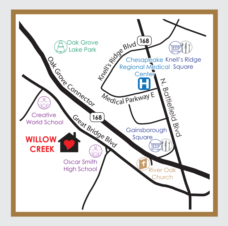
516 Great Bridge Blvd, Chesapeake, VA 23320