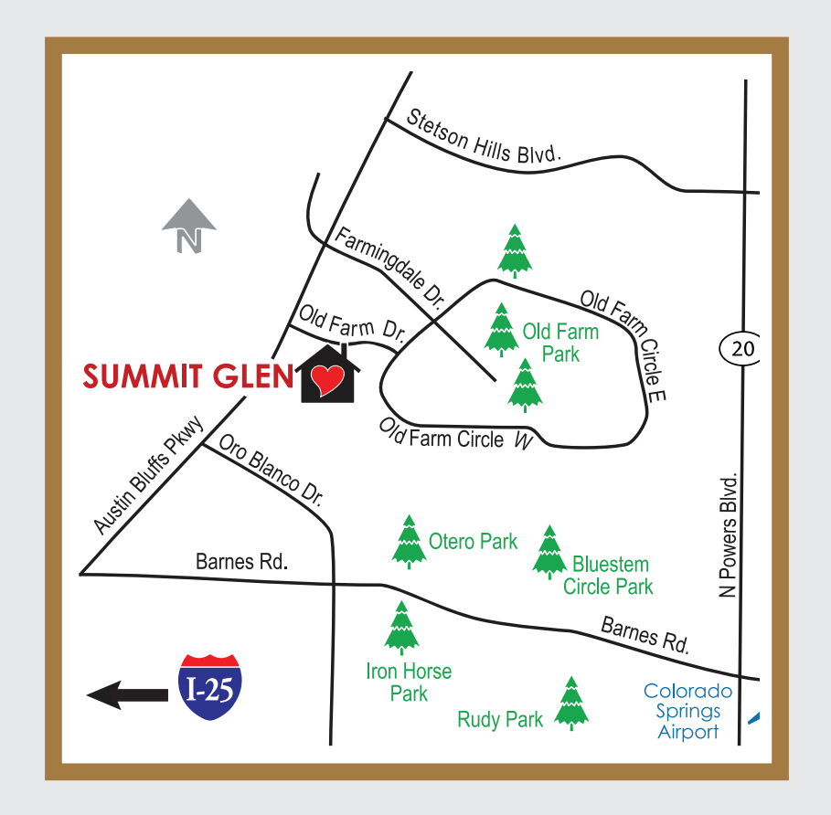
4825 Old Farm Drive, Colorado Springs, CO 80917