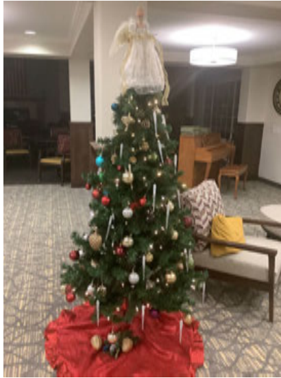
Activity Room Tree

Saturday, January 1st, New Year's Day: Write down a New Year's resolution that is obtainable this year and keep it somewhere safe. We'll look back after the year is over and see how you did!